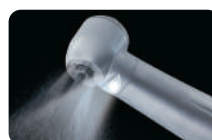
LED Piezo Scaler Handpiece